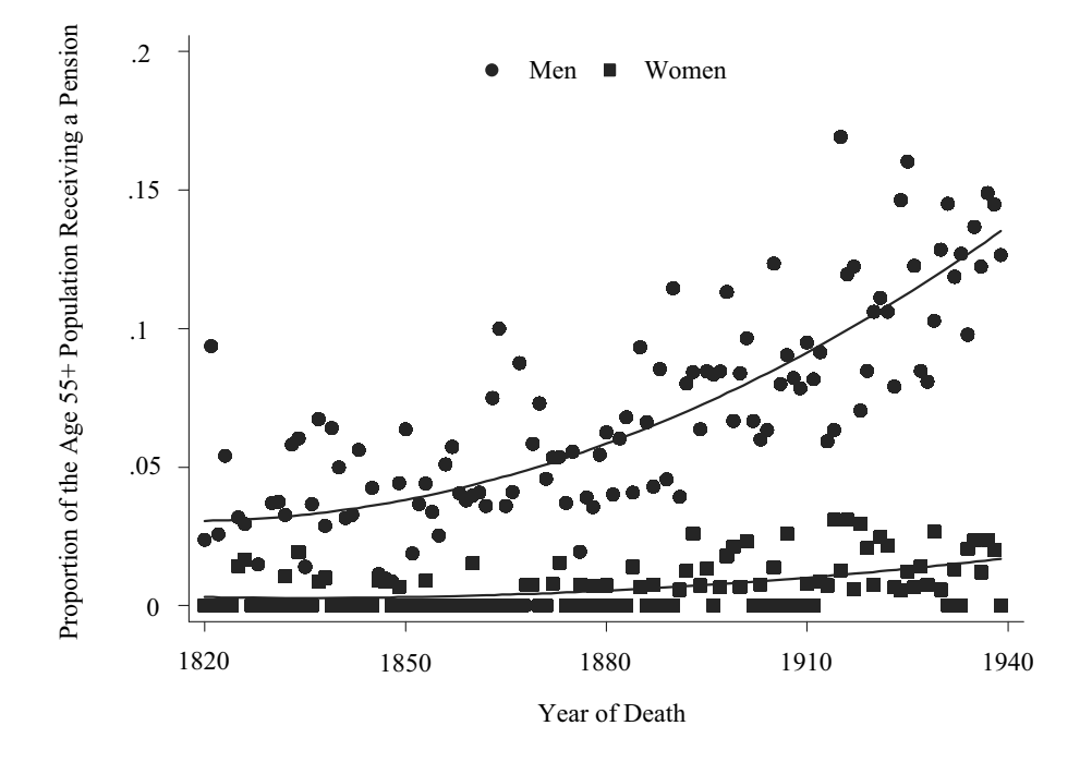
FIGURE 2 PROPORTION OF THE AGE 55 AND OVER POPULATION WITH "PENSION JOBS"

Sources: Compiled from the TRA database. The continuous lines are the quadratic trends for, men and women.